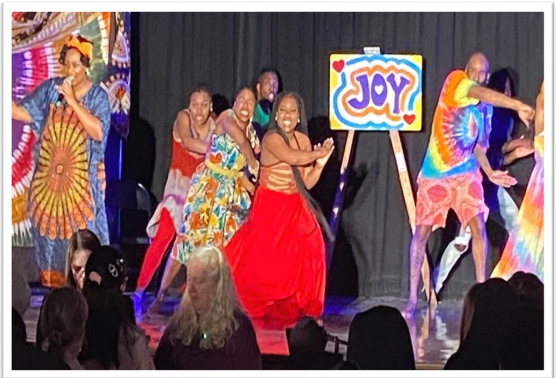
"Black Kid Joy" FPUU MLK benefit recipient

Ask not what the world needs. Ask what makes you come alive ... then go do it. Because what the world needs is people who have come alive. Howard Thurman