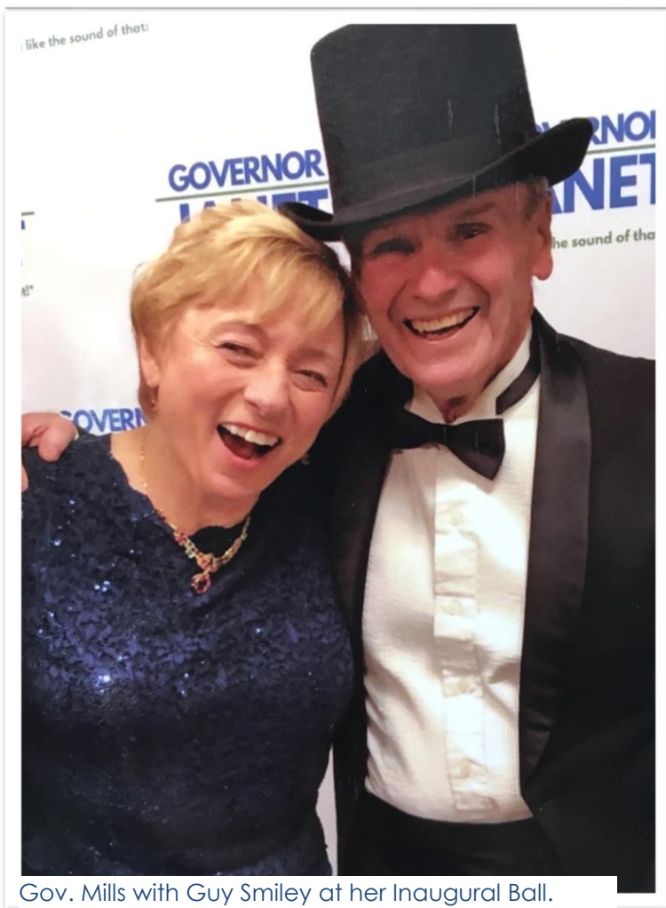
Gov. Mills with Guy Smiley at her Inaugural Ball.

uukennebunkoffice@gmail.com and she will connect you with the team.